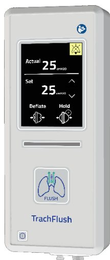
The TrachFlush™ Device

Invented by Alberto Zanella, an Italian intensivist, and developed by AW Technologies, TrachFlush™ is a medical device that maintains the tracheal tube cuff's pressure, preventing subglottic secretion microaspiration, and removes the secretion below the cuff and above (subglottic) the cuff non-invasively, lightening the workload for healthcare professionals and reduced patient discomfort.