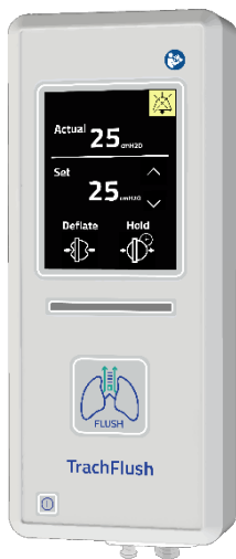
The TrachFlush™ Device

Invented by Alberto Zanella, an Italian intensivist, and developed by AW Technologies, TrachFlush™ is a medical device that maintains the tracheal tube cuff's pressure, preventing subglottic secretion microaspiration, and removes the secretion below the cuff and above (subglottic) the cuff non-invasively, lightening the workload for healthcare professionals and reduced patient discomfort.