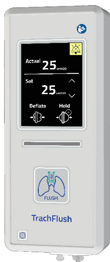
The TrachFlush™ Device