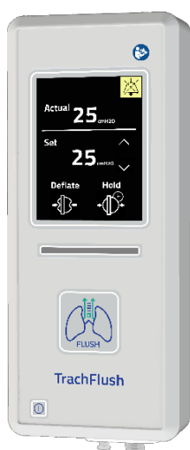
The TrachFlush™ Device

Invented by Alberto Zanella, an Italian intensivist, and developed by AW Technologies, TrachFlush™ is a medical device that maintains the tracheal tube cuff's pressure, preventing subglottic secretion microaspiration, and removes the secretion below the cuff and above (subglottic) the cuff non-invasively, lightening the workload for healthcare professionals and reduced patient discomfort.